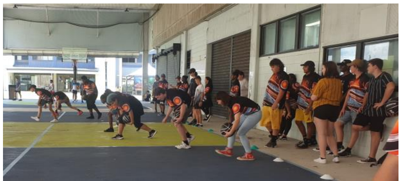
The girls keeping it deadly, showing the boys their B-ball Skills