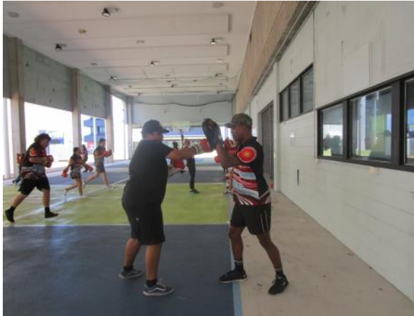
Boxing on a Monday Afternoon