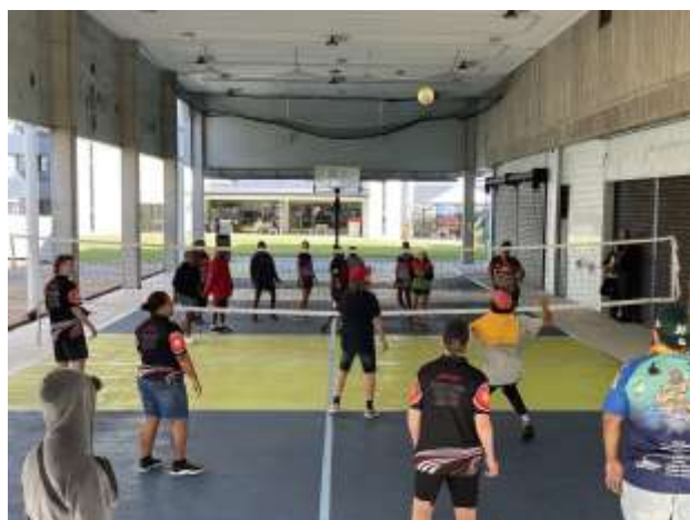
Right: KMG staff and students enjoying a ‘Friendly’ match of volleyball. There are a few undercover professional volleyball athletes in the making!