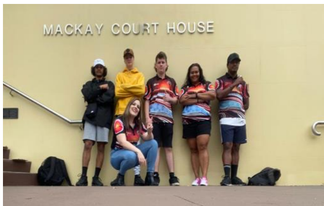
Take One— mmm, someone's missing...

It's challenging, it's changing and it's interesting.